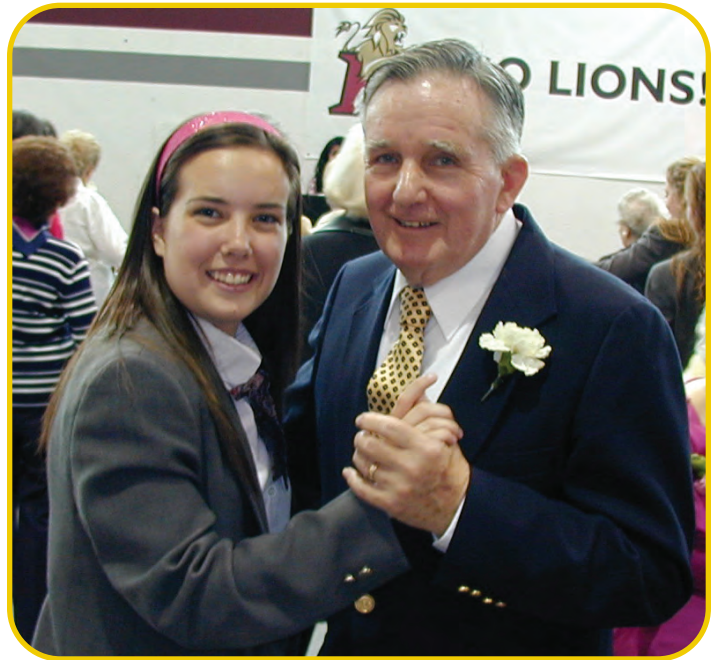
A Kellenberg student and senior cut the rug at our “tea dance.”

Our goal was to make the event rewarding for everyone involved. While projects directly improved the quality of life for those served by Catholic Charities, young people were also introduced to the importance of social justice