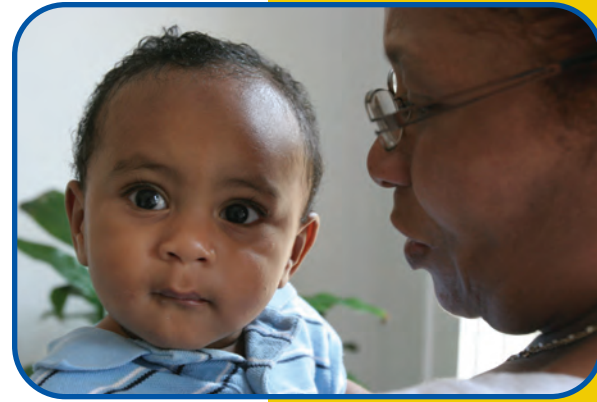
One of our new friends at Regina Residence.