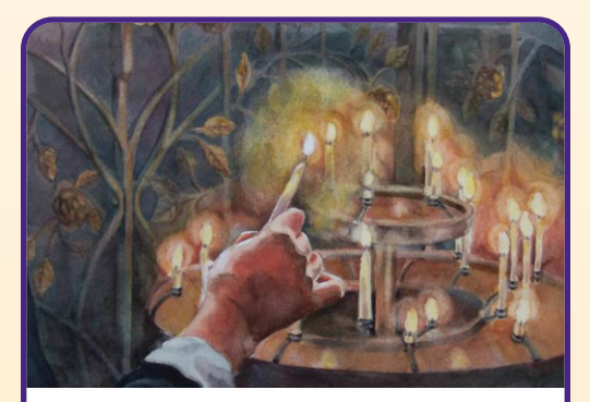
Memorial Cards Now Available

The Walmart Foundation for a $25,000 grant to our Nutrition Outreach Project. Since 2014 they've donated nearly $120,000 to help us eradicate hunger on Long Island!