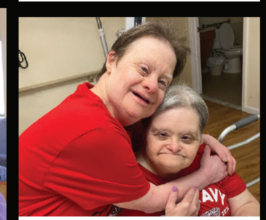
Residential Services for People With Developmental Disabilities* 103 served