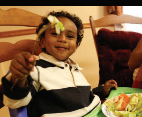
Food and Nutrition Services 12,735 served

*** Our Parish Social Ministry team also supported parish programs that serve people in their local communities with trainings and conferences that were attended by 2,689 people.