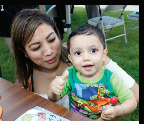
Immigrant Services/Refugee Resettlement** 5,992 served