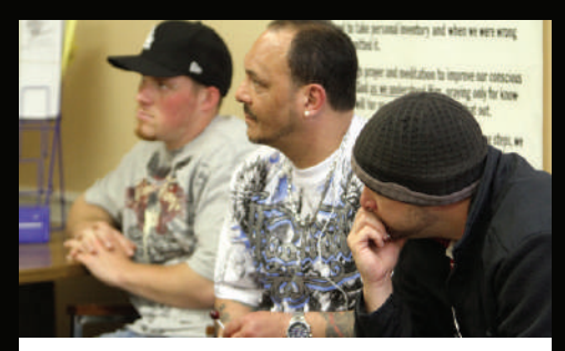
Addiction Treatment Services* 2,198 served

In 2022, Catholic Charities of Long Island provided more than 1.2 million loving, face-to-face services to 33,249 neighbors.