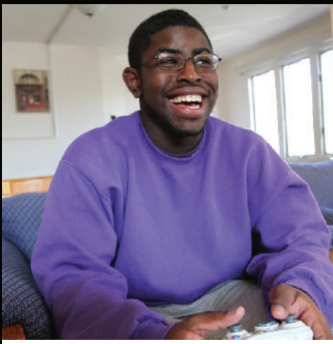
Mental Health Residential Services* 149 served