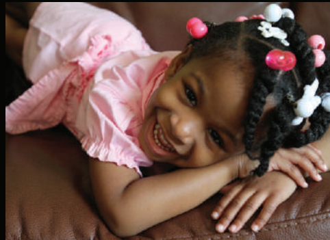
Regina Maternity Services 103 served