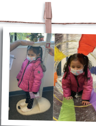
The caring healthcare providers with the Molloy College Cabrini Mobile Clinic who visited our Women, Infant, and Children (WIC) office in Freeport and provided free health screenings and a bit of fun for the children!