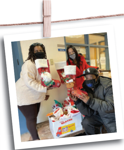
The elves of St. John the Baptist High School who brought Santa early to the kids in our Women, Infants and Children (WIC) program.