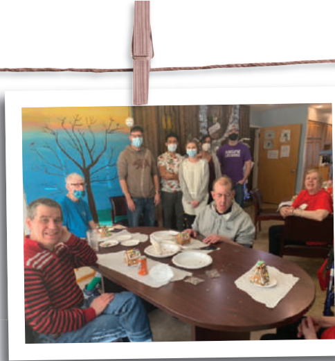
The future Physician Assistants from Touro College who kicked off the holidays with gingerbread houses at our Bishop Ryan Residence.