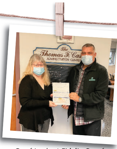
Our friends at Fidelis Care for providing Butterball turkey vouchers to our Parish Social Ministry team, making Thanksgiving brighter for needy families throughout Long Island.