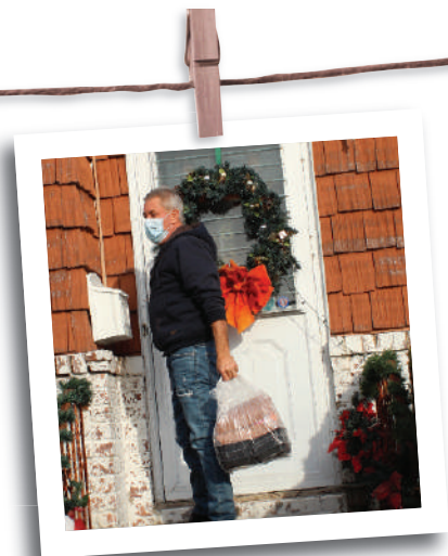
Our Meals on Wheels staff who delivered hot, nutritious meals to the homebound just in time for Christmas!