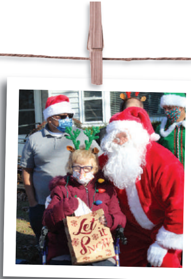
The students and teachers of St. John the Baptist High School for their annual Santa Parade that benefits the adults in our homes for the developmentally disabled.