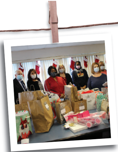
St. Anne's Church, Garden City for their annual Angel Tree which provided Christmas gifts to more than 50 children in our programs.