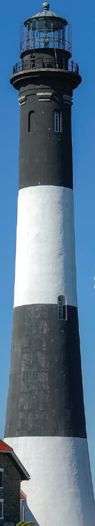
The lighthouse at the Fire Island National Seashore, Long Island, New York

Catholic Charities is funded by the Catholic Ministries Appeal of the Diocese of Rockville Centre, federal agencies, the State of New York, Nassau and Suffolk counties, the United Way of Long Island, foundations, third-party reimbursements, client fees, contributions, grants and bequests. Catholic Charities is a 501(c)(3) non-profit organization. Contributions to Catholic Charities are tax-deductible to the extent allowed by law.